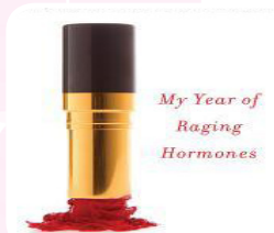
My Year of Raging Hormones